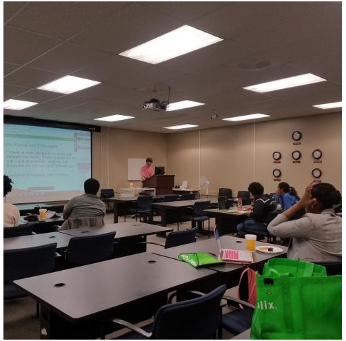
Teaching Philosophy Webinar