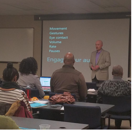
Curriculum Vita/Three Minute Thesis